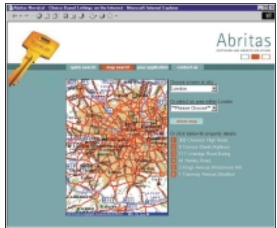
Zoomable maps for finding properties